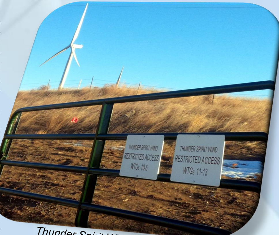
Thunder Spirit Wind, ND, 2015/18

COMPANY RESERVES THE RIGHT TO AMEND OR REPLACE THE INFORMATION CONTAINED HEREIN, IN PART OR ENTIRELY, AT ANY TIME AND UNDERTAKES NO OBLIGATION TO PROVIDE THE RECIPIENT WITH ACCESS TO THE AMENDED INFORMATION OR TO NOTIFY THE RECIPIENT THEREOF.