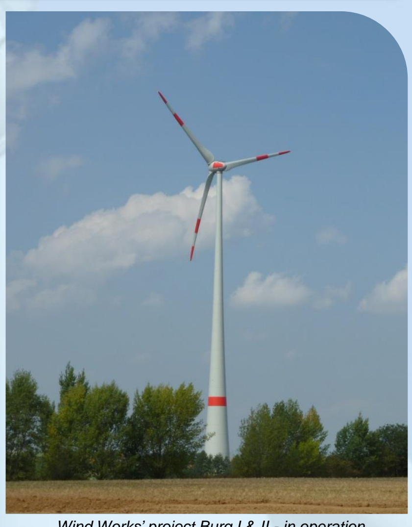
Wind Works' project Burg I & II - in operation 5 x Enercon E82 8